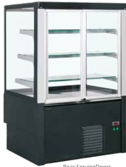
Rear Serving Doors